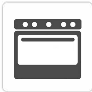
Clean inside oven