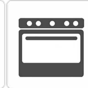
Clean inside oven