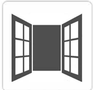
Interior window clean