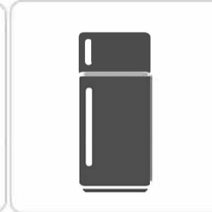
Clean inside fridge